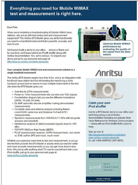
Figure 1.4 The follow-up email, timed to arrive shortly after the dimensional mail, resells the key product benefits and the compelling offer.