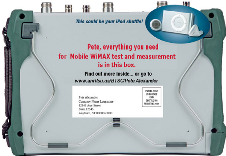
Figure 1.1 The dimensional mail's packaging shows a life-size replica of the instrument itself, along with a highly attractive offer, a personalized technical message, and personalized URL response vehicle.

Illustration used with permission from Anritsu Corporation.